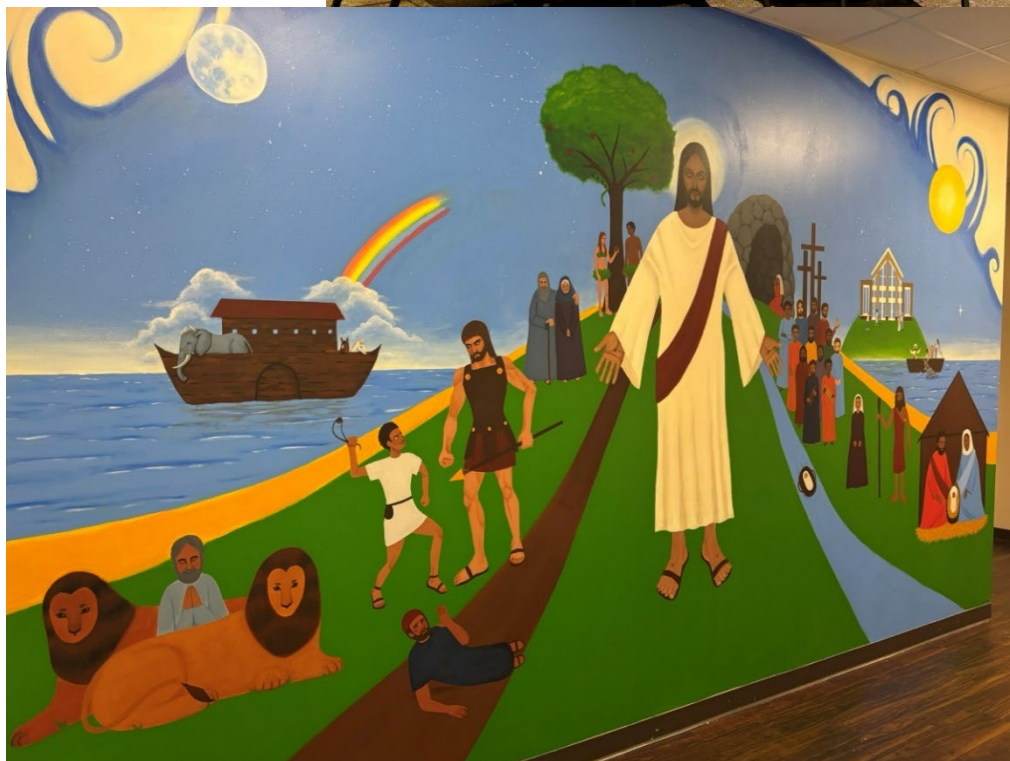
New mural created in Children's ministry hallway pointing kids to Jesus, stories of the Bible, and our calling today.